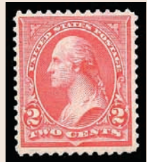
U.S. 251a LH/VF-XF Scarlet Shade $375.00