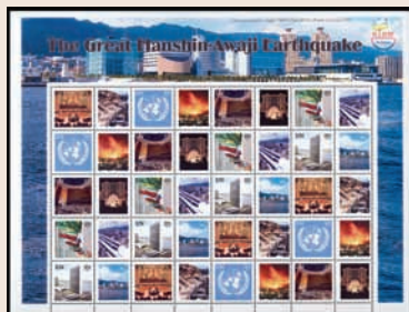
UN Personalized Sheet S4 2005 Kobe Earthquake 10th Anniversary $595.00

Henry Gitner is your Headquarters for Topicals.