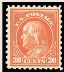
U.S. 439 NH VF Deep rich color $750.00