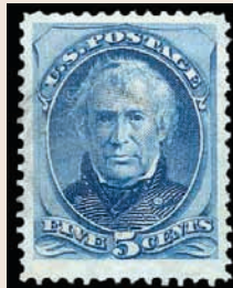
U.S. #179 Used Superb $100.00

Just a sampling from our enormous stock.